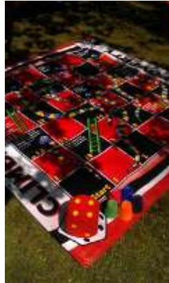
A giant Snakes & Ladders game got people thinking about poverty

"If you oppress the poor, you insult their Creator." Proverbs 14:31